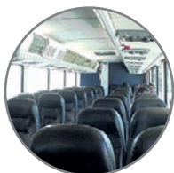
Aeroplane and bus interiors