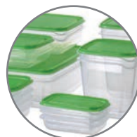
Food storage containers