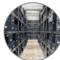
Document storage boxes