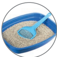
Cat Litter trays