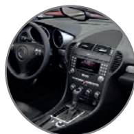
Car interiors Dashboards, arm rests and cup holders