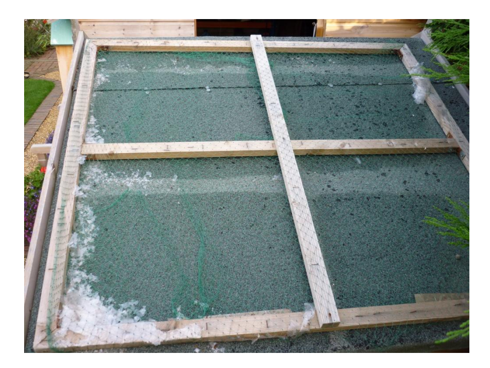
Figure 3: Exposure of films at Telford site- August 2013.

Figure 3 shows the condition of the films on 16<sup>th</sup> August 2013.