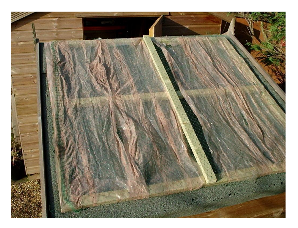
Figure 1: Exposure of films at Telford site- 1<sup>st</sup> November 2012.

Film DG12-05 is on the left of the central dividing bar and film DG12-06 is on the right.